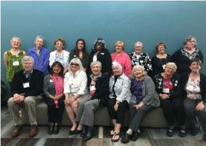
Delegates to the LWVWI 2018 Annual Meeting: